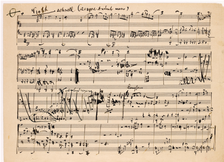
Gustav Mahler. Symphony no. 9: sketch draft of end of first movement.

A state-of-the-art Web site contains high quality digital images of most of the manuscripts in the collection. By logging onto juilliardmanuscriptcollection.org the user can examine the tiniest details of the scores, thanks to the site's use of "Ajax-zoom" technology.